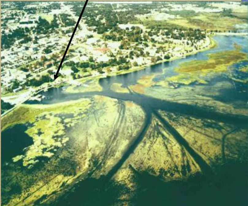
Public boat ramp