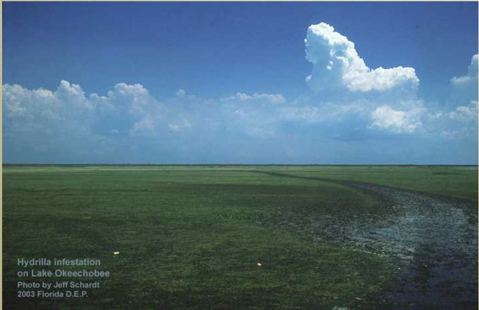
Hydrilla infestation on Lake Okeechobee