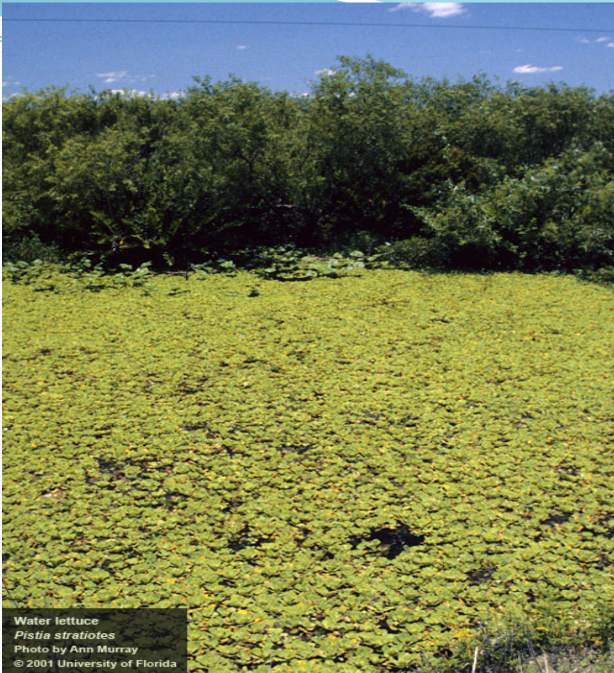
Water lettuce Pistia stratiotes