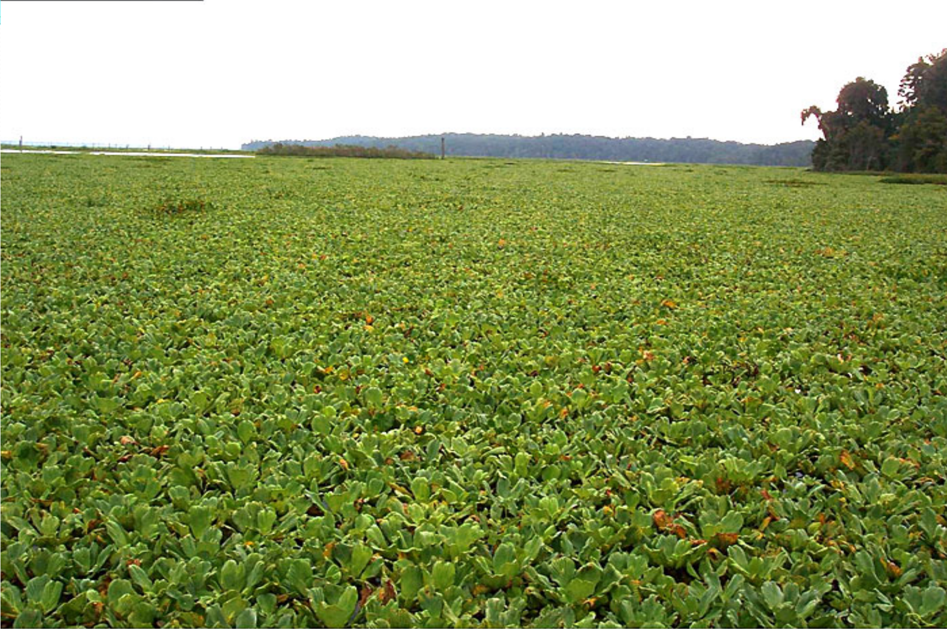
Water Lettuce Pistia stratiotes