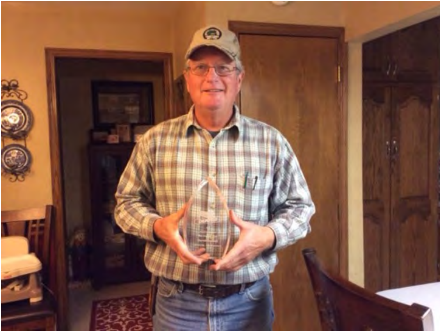
CORN GROWERS AWARD FOR THE STATE OF MISSOURI 2014