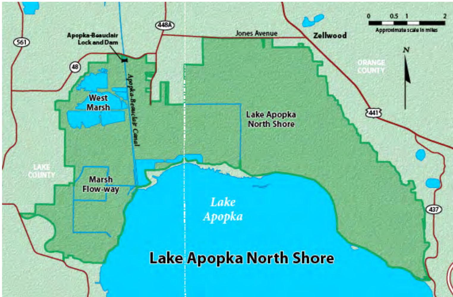
MAP OF LAKE APOPKA